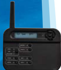
Wireless Tabletop Remote