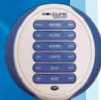
Wireless Spa-side Remote