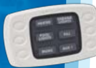
Wired Spa-side Remote