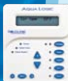
Wired Wall-mount Remote