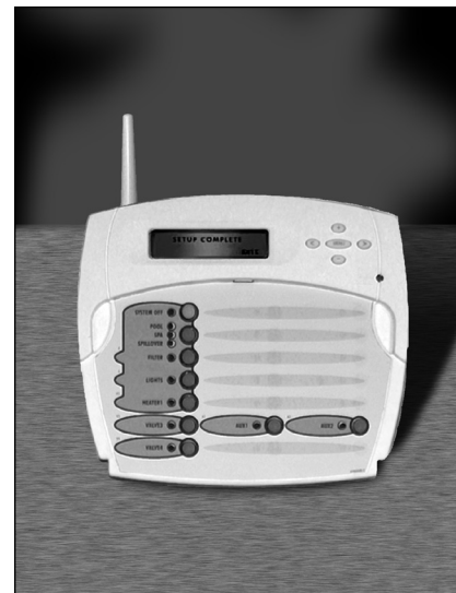
Wireless Wall Mount Display