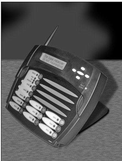
Wireless Table Top Display